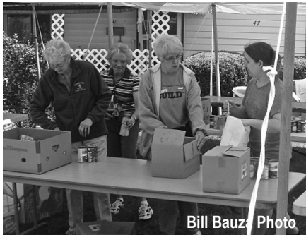
Bill Bauz Photo

Workshops will focus on topics related to Parenting